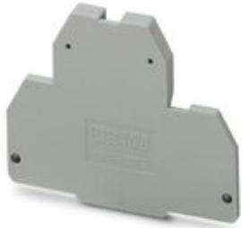
Spacer plate, length: 44 mm, width: 2 mm, color: gray

Please be informed that the data shown in this PDF Document is generated from our Online Catalog. Please find the complete data in the user's documentation. Our General Terms of Use for Downloads are valid ( http://phoenixcontact.com/download )